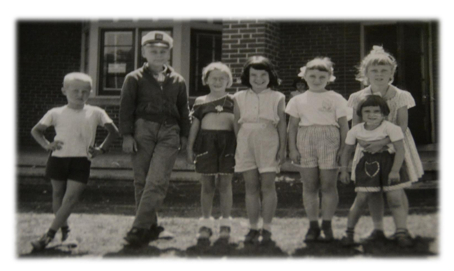
(We apologize for the picture quality in the printed newsletters.)

We continue to uncover more and more interesting pictures as we work through the archives. Even if you <u>THINK</u> you might know anyone in the photo or where it was taken, please let us know! We will have all pictures featured here at monthly meetings available for you to take a closer look at.