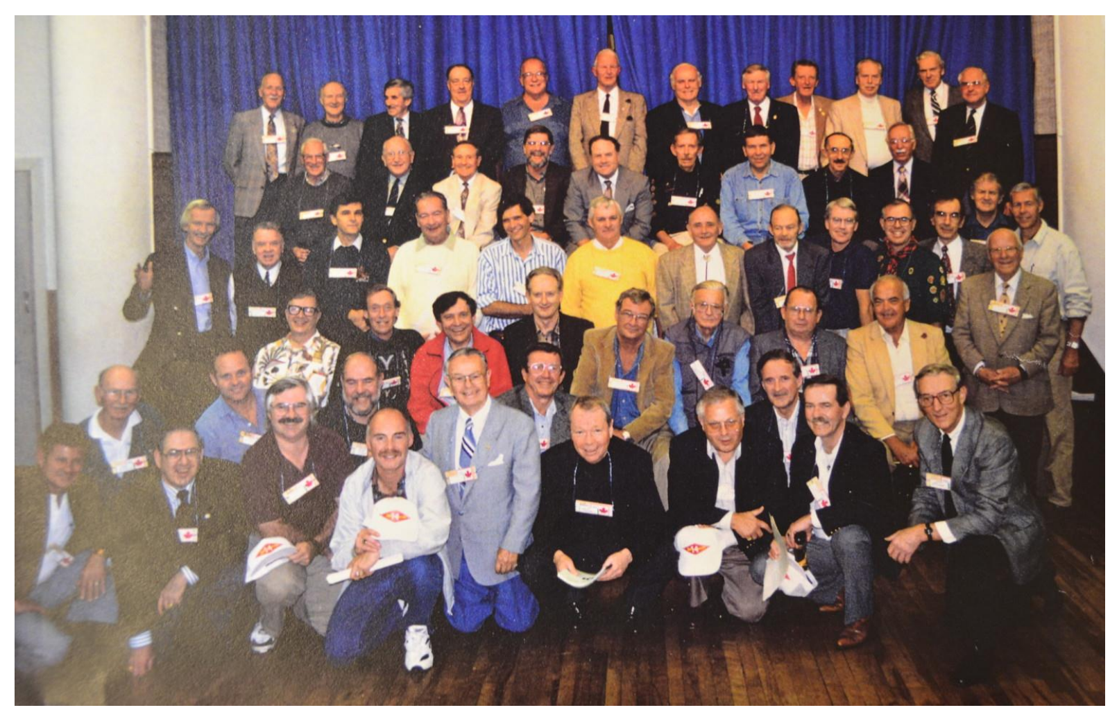
(We apologize for the picture quality in the printed newsletters.)

Here is another photo from the archives. Even if you <u>THINK</u> you might know someone or something about the picture, please let us know! We will have all pictures featured here at monthly meetings available for you to take a closer look at.