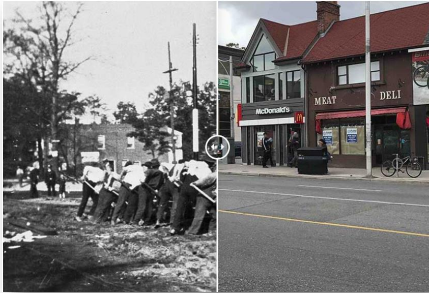
Laying tracks in 1917 at Runnymede and Bloor, in front of CIBC (now McDonalds).

swanseahistoricalsociety.ca/swansea-history/photos