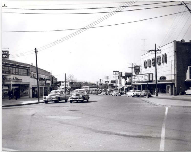
The Odeon Theatre on Bloor west of Jane was showing a Mickey Rooney movie in 1953.

This month's page is Bloor West Village: swanseahistoricalsociety.ca/swansea-history/bloor-west-village